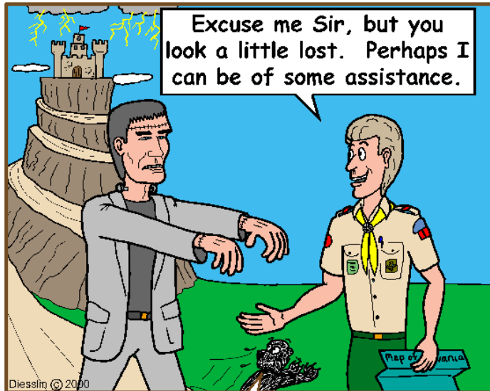
Good manners are always appropriate ... yike!

The Eagle Vision is the official interim publication of Timuquan Lodge. Submissions are always welcome and encouraged, but the editors reserve the right to edit material for both content and length.